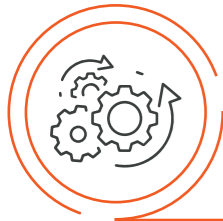
Figure 2 – Navigating Bond Labels in the Sustainable Bond Market

Over 16% of 2022 global offerings are structured with a sustainable label 1 . While use of proceeds green, social, and sustainability bonds dominate, accounting for over 90% of activity, interest is growing in the sustainability-linked format.